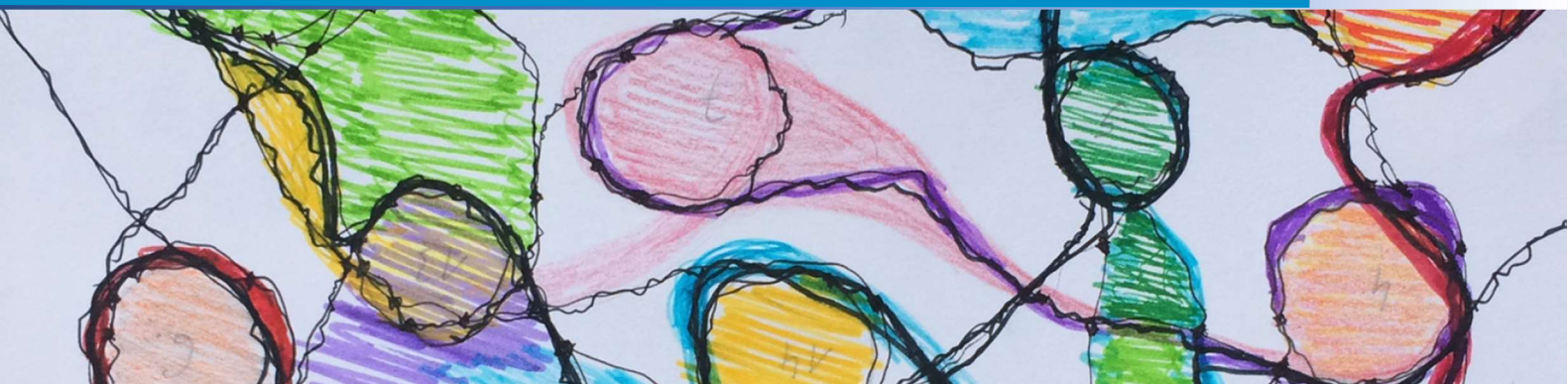
Illustration: Harald Schellander